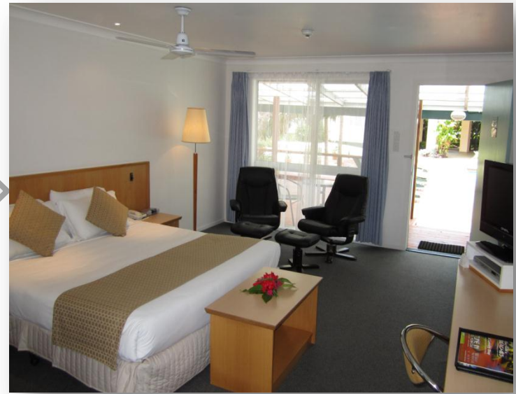
Poolside Superior Room

Our luxurious Poolside Superior Rooms with deck are set among manicured sub-tropical gardens and overlook our stunning pool area. Each room comprises of a king bed, private bathroom, Plasma satellite television, DVD player, refrigerator and more