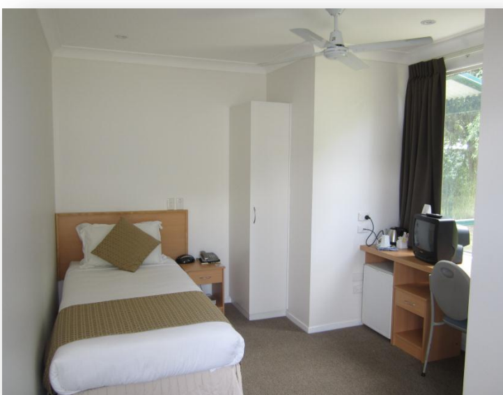
Economy Single Room

Our Economy Single Rooms located just metres from the swimming pool have recently undergone major renovations and are the ideal option for the budget conscious traveller. Our economy rooms are comfortable single person accommodation units and are equipped with King Single beds, brand new bathrooms, satellite television and DVD player, refrigerator and more.